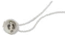
1PHB - GU10-GZ10