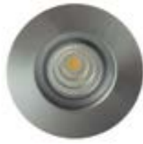
05 Inox / Inox / Inox