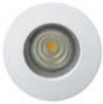
90 Blanco Técnico / Technical White / Blanc Technique