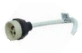
1PHG - GU10 100-240V